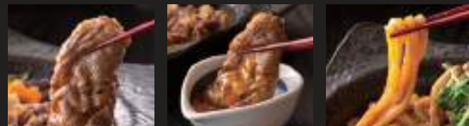
1. Savour as is. 2. Dip in egg. 3. Enjoy the udon noodles.