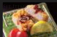
Pork loin cutlet