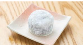
DAIFUKU 大福 NEW - SHIRO (ORIGINAL) 白 - SAKURA さくら - BLACK SESAME 黒胡麻 $4.80-