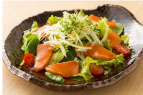
SALMON SALAD サーモンサラダ $14.00-