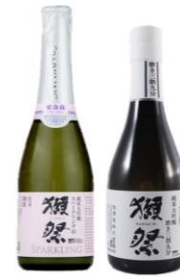
DASSAI SPARKLING45(360ml) 獺祭スパークリング純米大吟醸45 $45.00- DASSAI 39(300ml) 獺祭純米大吟醸磨き39 $48.00-