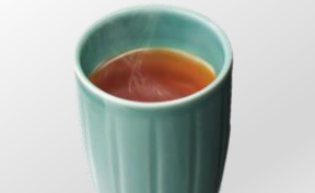
ROASTED GREEN TEA ほうじ茶 $3.00-