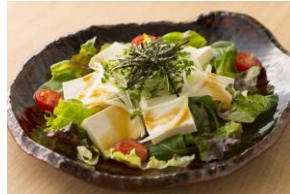
TOFU SALAD 豆腐サラダ $12.00-