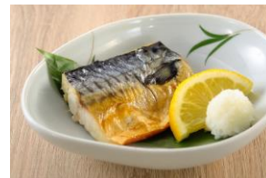
HALF SABA SHIO-YAKI ハーフ鯖塩焼き $6.00-