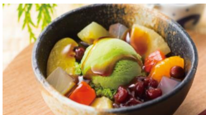
MATCHA ANMITSU 抹茶あんみつ $9.50- ICE CREAM ONLY $4.50-