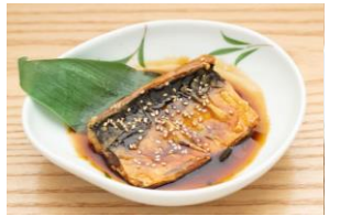
HALF TERIYAKI SABA ハーフ照り焼き鯖 $6.00-