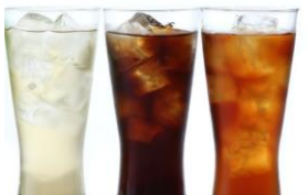
SOFT DRINKS (COKE/CALPICO etc.) ソフトドリンク各種 From $3.50-