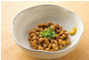
NATTO 納豆 $3.00-