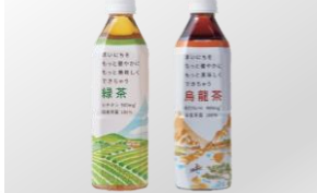
BOTTLE OF TEA ボトルティー $4.80-