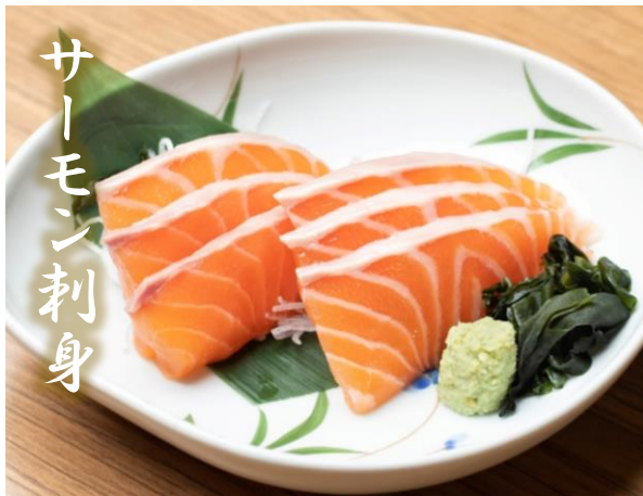
SALMON SASHIMI サーモン刺身 6pcs $12.00- 3pcs $6.00-