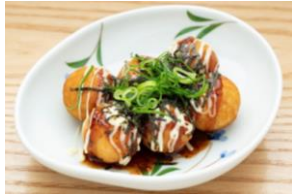
TAKOYAKI 6pcs たこ焼き 6ピース $8.00-