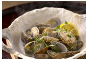
ASARI SAKAMUSHI アサリの酒蒸し $12.00-