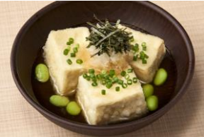
AGEDASHI TOFU 揚げ出し豆腐 $6.00-