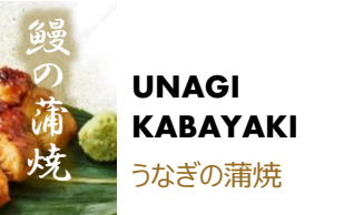
UNAGI KABAYAKI うなぎの蒲焼 $18.00-