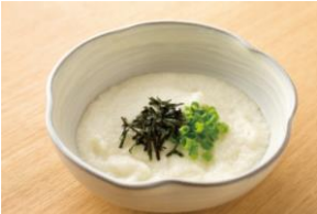
TORORO とろろ $3.00-