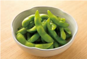
EDAMAME 枝豆 $5.00-