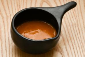
CURRY カレー $8.00-