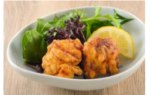
KARA-AGE 2pcs (MILD or SPICY) 唐揚げ 2ピース (ノーマルorスパicy) $5.60-